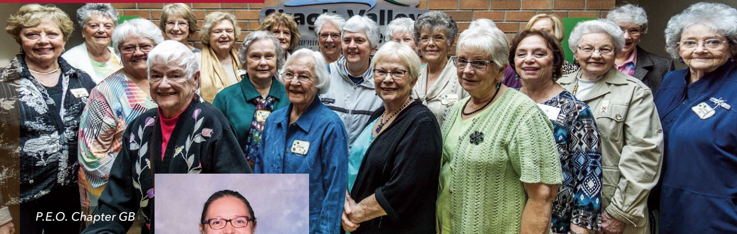
P.E.O. Chapter GB