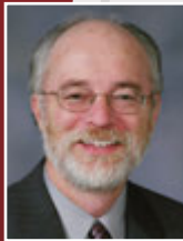
John Stephens Chair