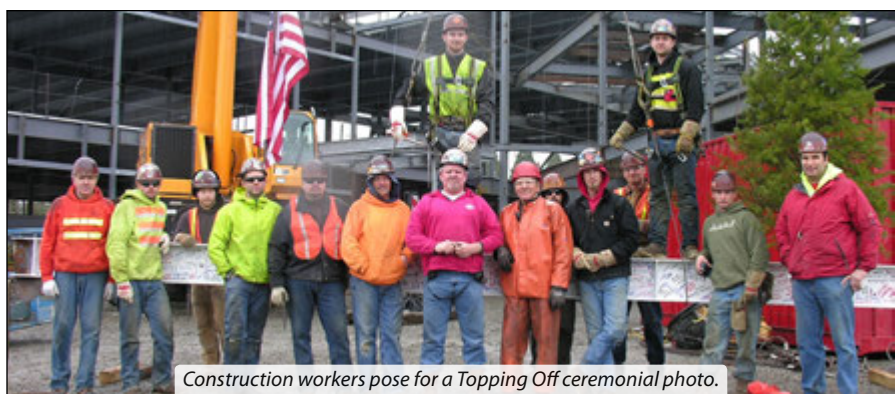
Construction workers pose for a Topping Off ceremonial photo.