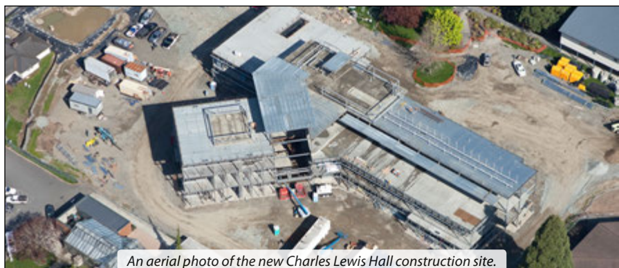
An aerial photo of the new Charles Lewis Hall construction site.