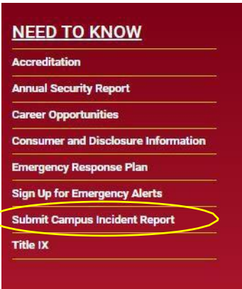
Figure 1 List with "Submit Campus Incident Report" circled in yellow

Under the "NEED TO KNOW", click on "Submit Campus Incident Report"